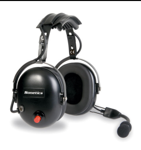
4X Headsets (other options also available)